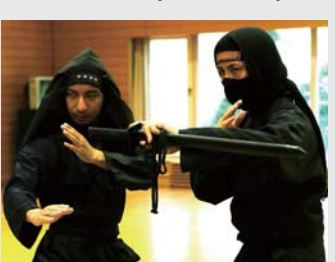
Ninja Spy Action