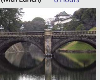
Meiji Jingu, Imperial Palace, & Nihombashi Walk 4 Hours