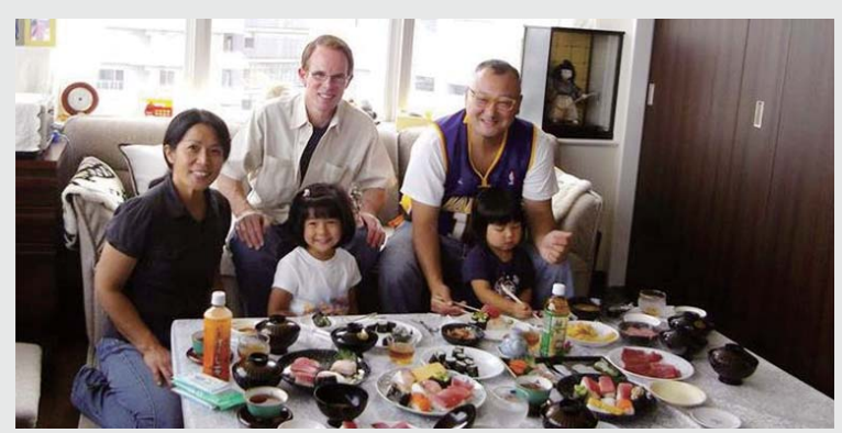
Sushi Making and Sushi Party at a Private Residence

We offer private arrangements with special venues and provide instructors only for your group.