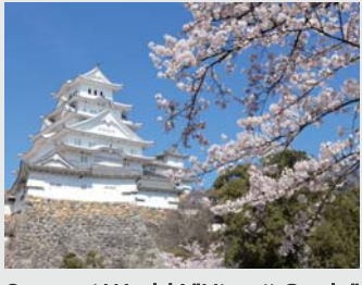
Samurai World ! "Himeji Castle" 4 Hours