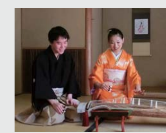
Koto (the Japanese Harp)